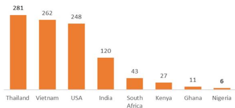
Figure 1: Number of tractors per 10,000 hectares of arable land