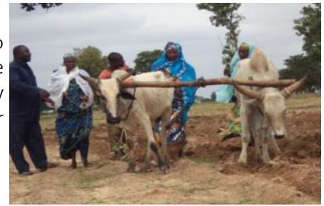
Animal Power based Mechanization.

This is the use of animals such as horses, oxen, mules, donkeys and bulls to drive primary tillage implements and to transport farm produce. It is the second highest level of mechanization. The quantity of work achieved by draught animals varies considerably, but can be up to 5 to 20 times greater than human labour.