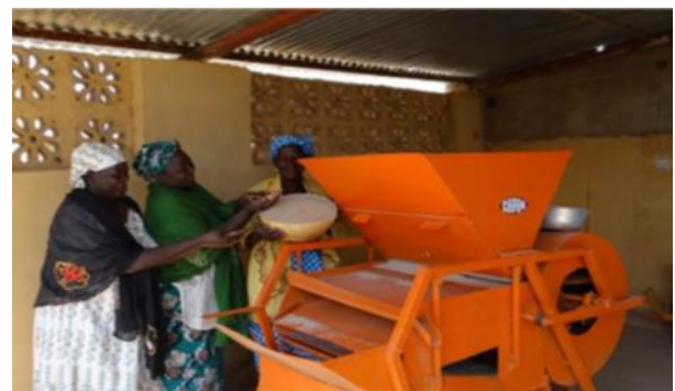
Grain Milling Machine.