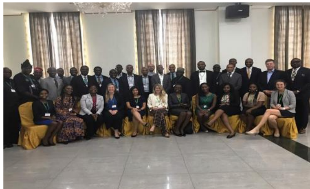
Cross section of participants, FAFIN Investors Conference, 2017

The 2017 Conference was recently held in Lagos, at the Oriental Hotel and Sahel's offices. It was a two-day event from 14th to 15th November 2017 with about 50 participants comprising of representatives from FAFIN's investors, portfolio companies, and pipeline companies; as well as selected guest speakers and Sahel team members. The Conference included detailed presentations and discussions on various agricultural value chains, closed-door sessions with FAFIN's Shareholder Board and Investment Committee, and targeted Environmental Social and Governance (ESG), tax compliance, and HR training for FAFIN portfolio companies.