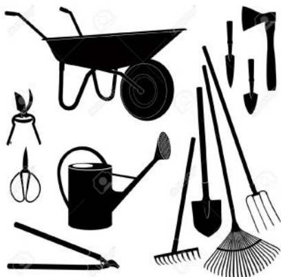
Human Powered Implements

This is the use of hand tools and manually operated equipment that rely on human power. Most of the activities in the agricultural sector in Nigeria are carried out with traditional equipment such as hoes and cutlasses. Human powered implements are the lowest level of mechanization, and result in limited agricultural productivity of farmers.