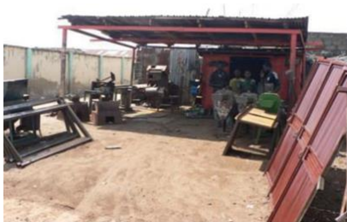
Local equipment fabrication workshop

The majority of agricultural technology used in Nigeria is sourced from India and China. Subsequently, they do not often fit Nigeria's agro-climatic environment. Apart from this, high tariffs and the epileptic supply of electricity contribute greatly to the underdevelopment of the agricultural equipment fabrication in Nigeria. According to the School of Engineering of the Federal Polytechnic, Ado Ekiti, 60% of agricultural equipment fabricated in Nigeria are small household processing machines made by fabricators who are not properly trained. Furthermore, many of the small household processing machines do not meet local demand in terms of quality and productivity.