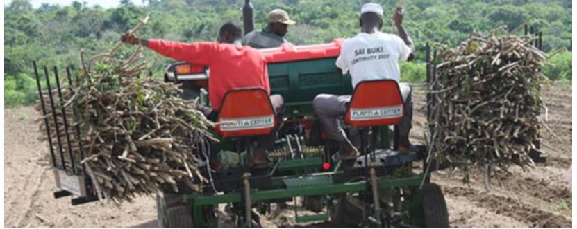
Two-row cassava planting machine.

Initiatives such as the Cassava Mechanization and Agro-processing Project (CAMAP), have increased the adoption of mechanization for crop production amongst farmers by providing implements such as cassava planting machines and cassava harvesting machines to farmer clusters in Ogun, Oyo, Osun, Kwara and Kogi. Since inception, the project has not only trained and empowered 250 cassava farmer clusters, but also covered 12,000 hectares of land using mechanization since 2013.