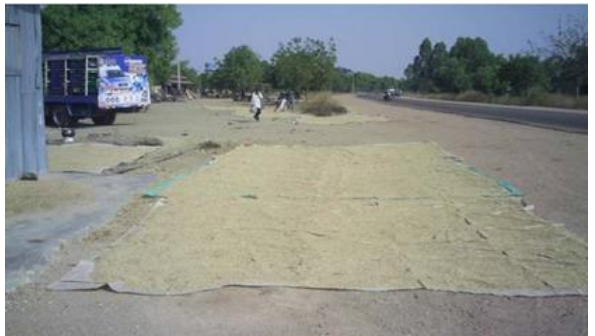
Sun-drying paddy rice.

Generally, farmers and small-scale processors dry produce on village roads and along highways leaving room for contamination by debris, insects and small ruminants. For example, maize is sun-dried using old sacks as the base material, shelled by hand, and stored in rooms with high humidity levels. Poor post-harvest handling practices in Nigeria have led to an alarming amount of food loss.